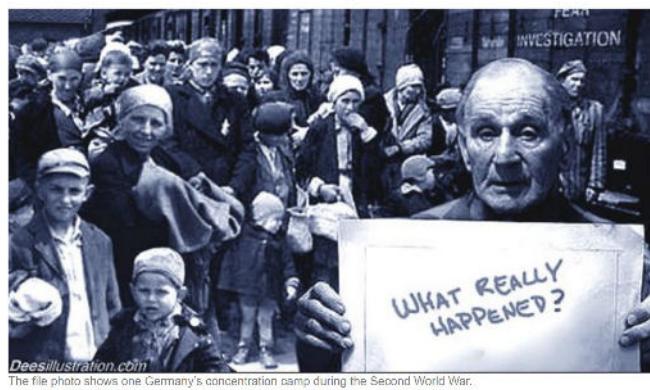
Headline and image from a Press TV article about the Holocaust published in 2014