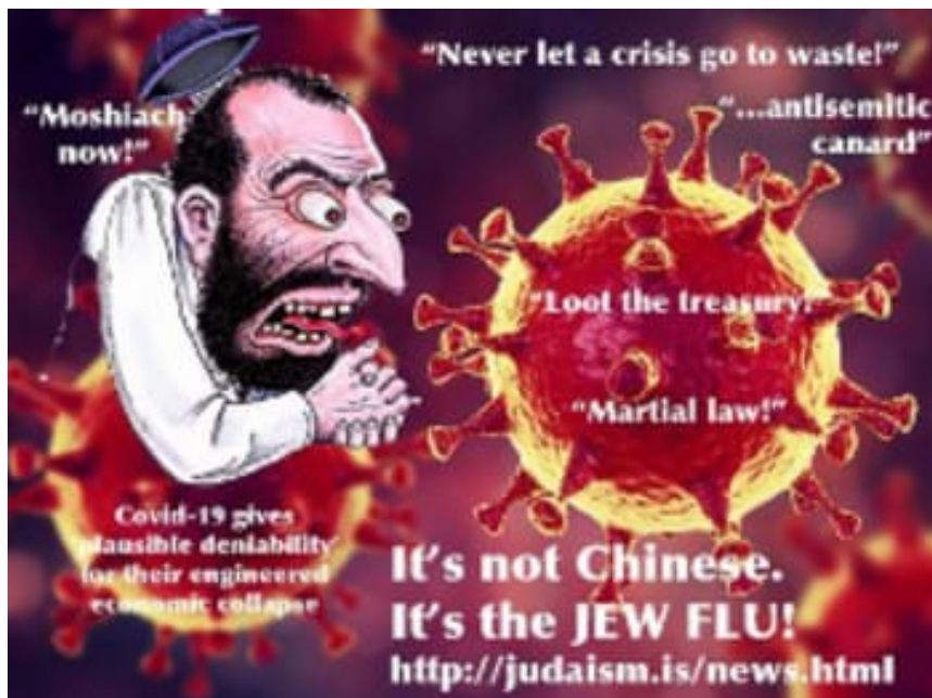
Figure 4. Distributed on social networks- unknown source