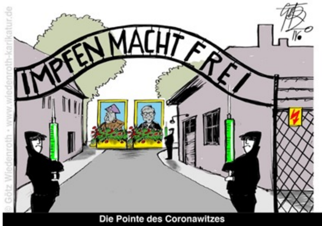
Figure 10. The entrance to Auschwitz with the words ' Vaccination liberates ' instead of ' Work liberates '

The term Holocough – combining Holocaust with cough, is widespread in the social media, especially among neo-Nazis and white supremacists. Some arguments claim that coughing is a means employed by Jews to harm the white race. In addition, sceptics argue that there actually is no epidemic, and that current events are all part of a Jewish-Zionist plot to take over the world. Direct calls are propagated to attack Jews by spreading the virus among them (for instance the rhymes "If you have the bug, give a hug" and "Spread the flu to every Jew"). This trend reached a peak in a sign raised in a demonstration in the US: "Synagogues are closed – the gas chambers are open"