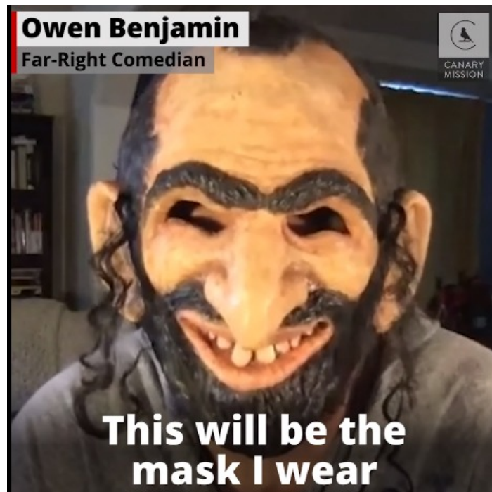
Figure 5. https://www.facebook.com/CanaryMission/videos/262468158196528/?t=1

Claims propagated in Iran and Turkey assert that the Zionists, together with the US, are the source of the pandemic, and will gain from it when thousands of Muslims die in the Middle East, particularly in Iran.