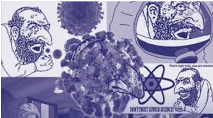
Figure 2. The classic image of the Jew depicted with the coronavirus

Antisemitism toward Haredim in the US: Jews of the Haredi community – mainly in the US – are seen as spreaders of the virus because they supposedly disregard the rules, and view themselves, as always, as living outside the law that binds everyone else; and when ultimately Jews are infected with the virus – it's because they rejected the teachings of Jesus Christ and crucified him.