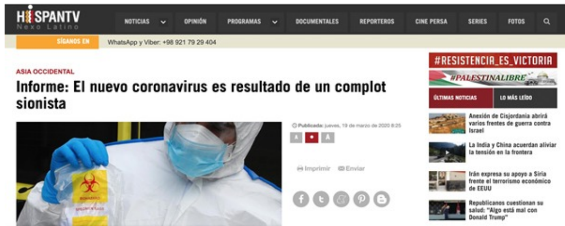
Figure 7. An item appearing on Hispan TV – the Iranian Spanish-language propaganda website, under the title: "Report: the new coronavirus is the result of a Zionist plot"

Israel and the IDF are constantly accused of spreading the virus by force among Palestinians , especially inmates in Israeli prisons. This claim completely ignores the facts: So far only one person has died of coronavirus in the Palestinian Authority and Gaza. The accusation is especially rife in networks that regularly promote the vilification of Israel.