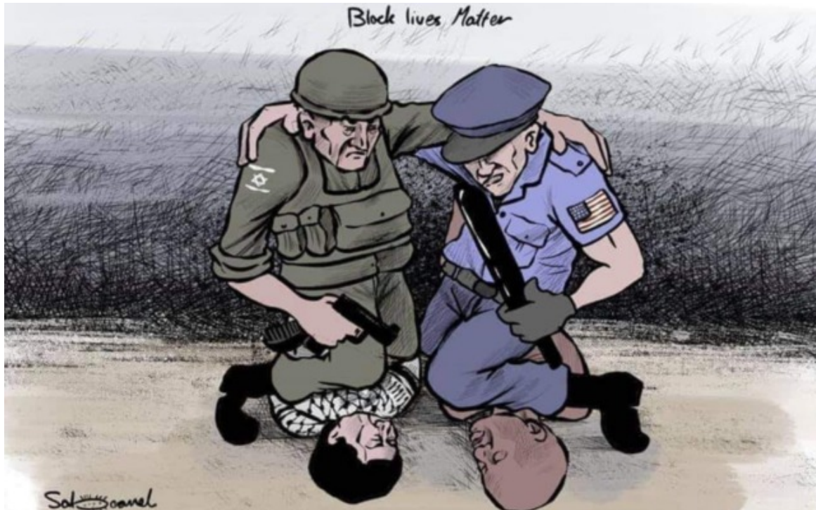
Figure 12. A cartoon showing an Israeli soldier and American policeman supporting each other as they kneel on a Palestinian and a black man, choking them.