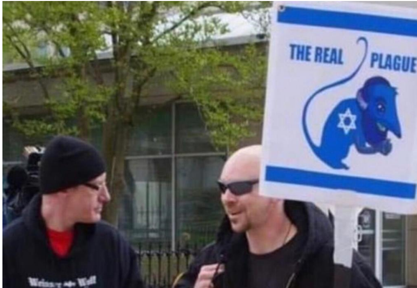
Figure 3. A protestor in the US