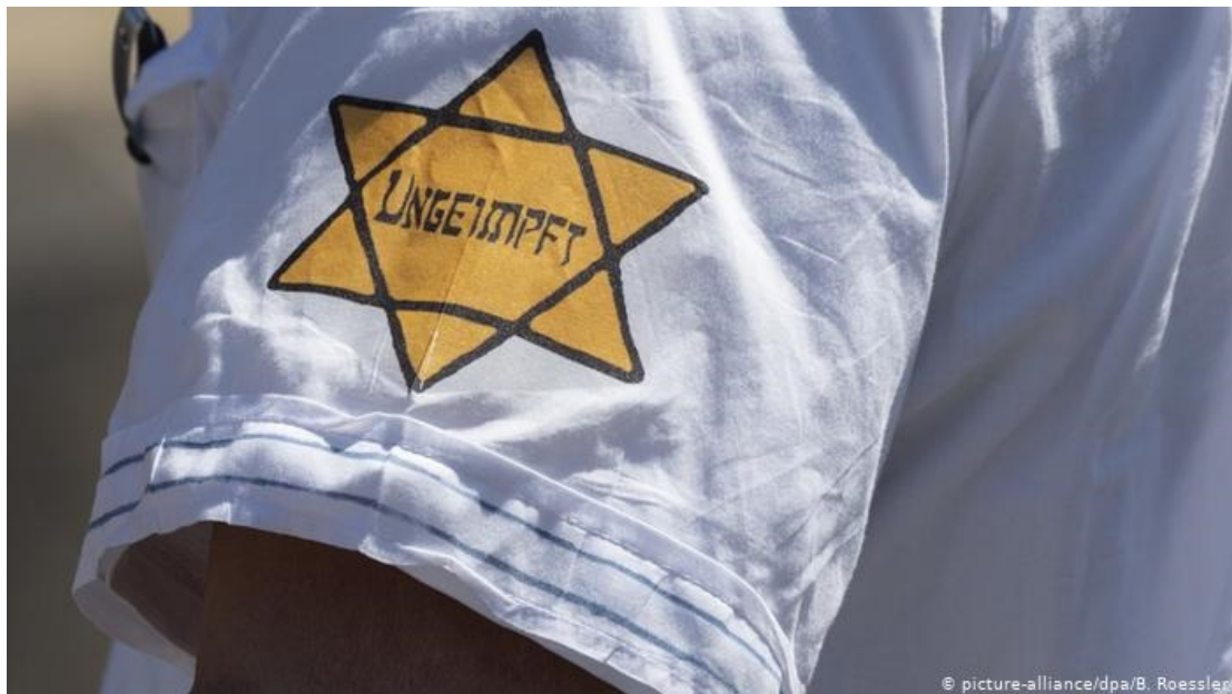
Figure 9. A German demonstrator wearing a yellow star with the word 'unvaccinated' replacing 'Jew'

Distorting terminology associated with the Holocaust: Restrictions enforced as part of anti-pandemic policies are compared to policies of the Nazi regime: Lockdown is likened to the ghettos and release from it to the German slogan Arbeit Macht Frei (work liberates) which appeared at the entrance to Auschwitz; The word 'unvaccinated' replaces 'Jew' on the yellow star worn by demonstrators protesting against vaccination policies, suggesting that those who have not been vaccinated are like Jews persecuted in Nazi Germany, and that those who disagree with vaccination opponents see them as disease spreaders – like the Jews. This phenomenon became so widespread that in Munich it is now forbidden to wear the yellow star in demonstrations.