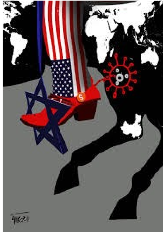
Figure 6. Caricature by Turkish artist Yuksel Cengiz , submitted to the international competition 'We are beating the coronavirus' organized by Iran in March 2020.

Additional Muslim interpretations regard the virus as a God-sent punishment to 'the enemies of Islam', which include many different nations.